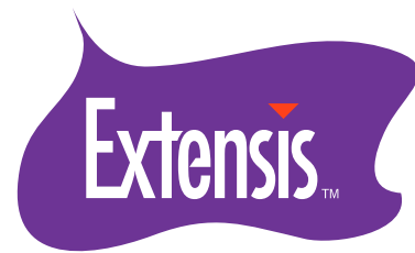
On color, black or photographic background

The Extensis logo can appear on black or other background colors, and on photographic backgrounds, as long as the legibility of the logo is not diminished. If printing on a black or dark background color, the white type logo should be used.