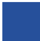
C: 100 M: 72 K: 6