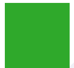
C: 76 Y: 100 K: 11