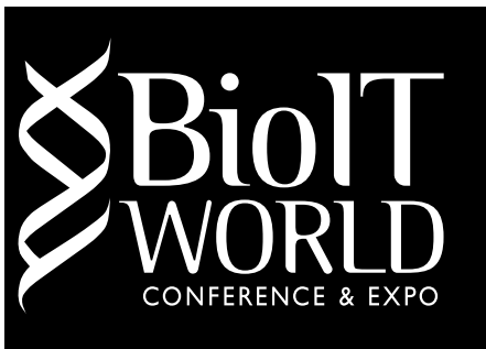
White BioITWorld Conference & Expo Logo