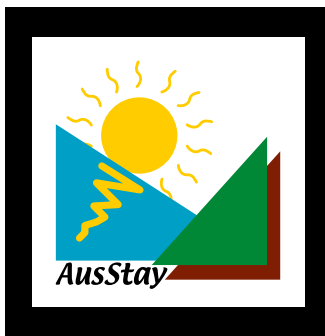
On background other than white